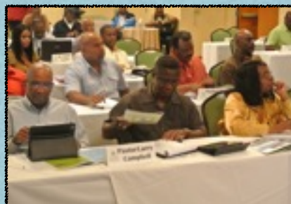
Demonstrating Collective Power!