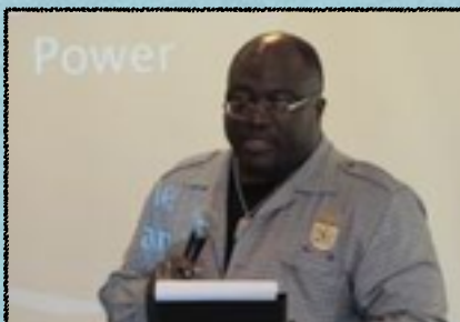
Leading Legislative Research Actions...